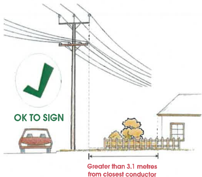
Low Voltage and 11 000 volts

The minimum safe clearance between powerlines and buildings depends on the voltage of the powerline and the type of conductor. The different types of powerlines can usually be recognised from their construction, however, check with ETSA Utilities if you are not sure what the powerline voltage is. The Technical Regulator website contains a list of personnel at ETSA Utilities who can be contacted for voltage identification.